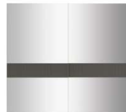
wardrobe code 6025F / grey +transparent mirror +milled ribbed lacquer