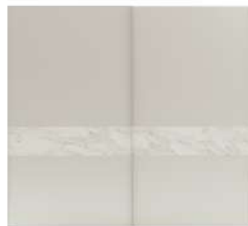
wardrobe code 6025A / grey +marble silk-screened glass