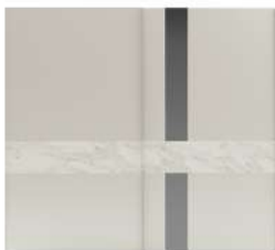
wardrobe code 6025C / grey +marble silk-screened glass +smoked mirror