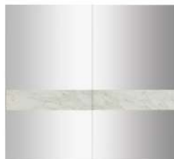
wardrobe code 6025B / grey +transparent mirror +marble silk-screened glass