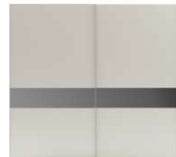
wardrobe code 6025D / grey +smoked mirror