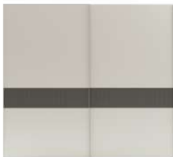
wardrobe code 6025E / grey +milled ribbed lacquer